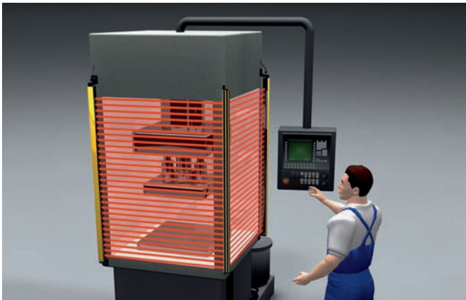
Safeguarding danger points on presses with 20 mm resolution for hand protection

Regardless of your safety application, the SOLID-4E series offer reliable protection with their robust and fail-safe construction. Ensures the highest level of system availability.